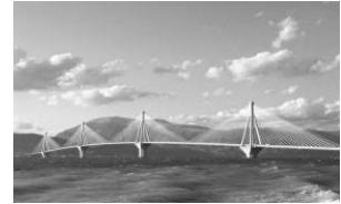
Rion-Antirion Bridge, Greece