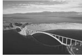
Krk Bridge, Croatia