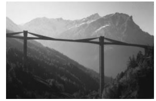
Ganter Bridge, Switzerland